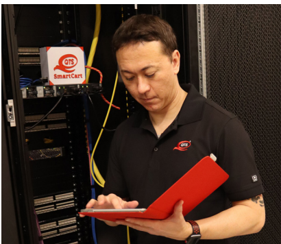
QTS technician connects to your designated device.

Available today at select QTS data centers. Check with your QTS Sales Team for location availability.