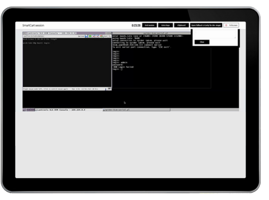
Reserve and utilize SmartCart service via QTS digital platform, SDP.