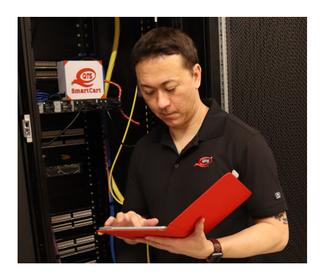
QTS technician connects to your designated device.

Available today at select QTS data centers. Check with your QTS Sales Team for location availability.