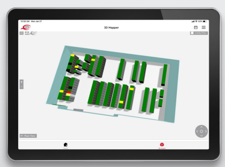
Visualize your QTS space in 3D in real time